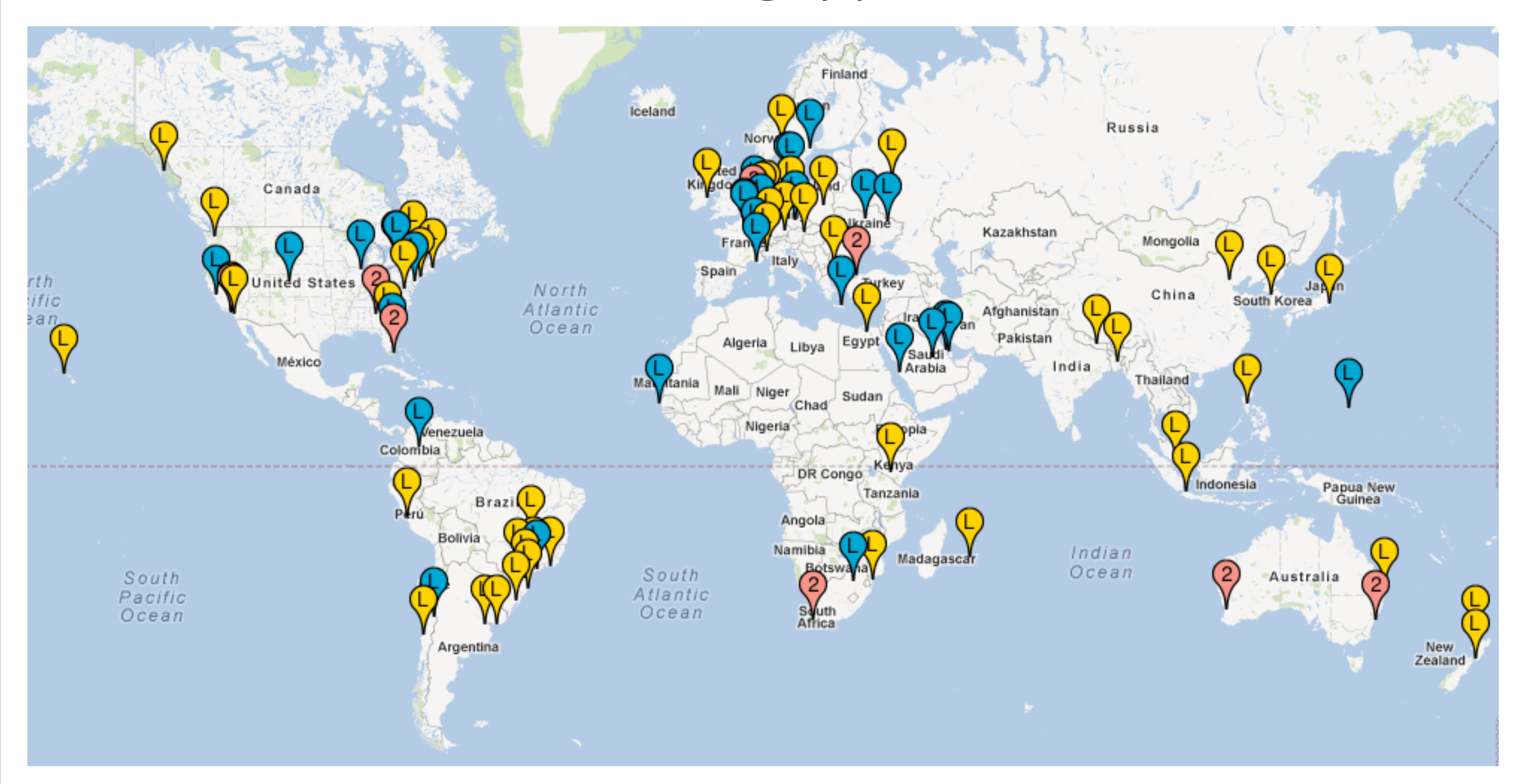
95 physical servers and 146 VMs at 103 locations