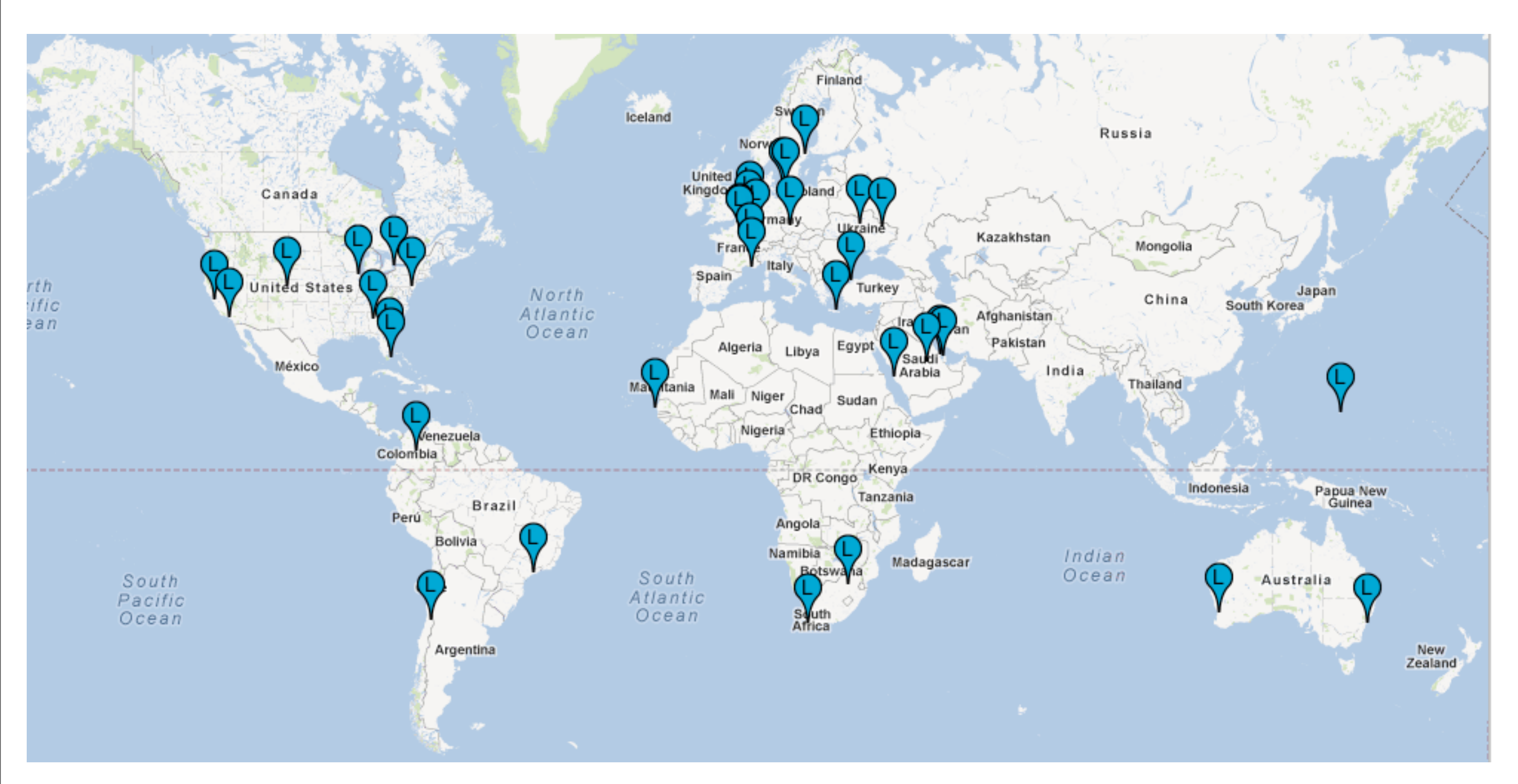
68 servers at 37 locations